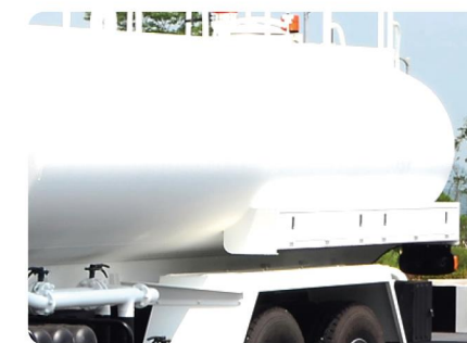
Choice of Tank Sizes

Water tanks vary in volume of small and medium-sized large tanks.