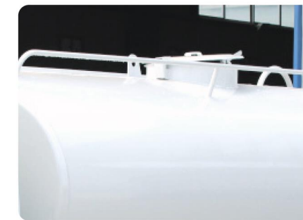
Manholes & Walkway

The tank has a pair of manholes on the top, one toward the front and one at the rear.