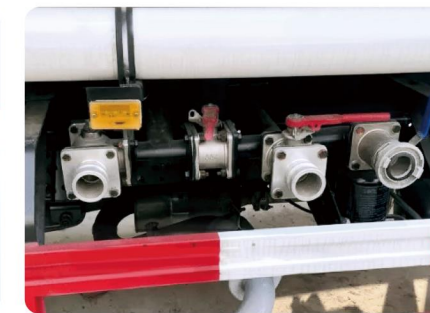
Self-Priming Centrifugal Pump

The tank has a pair of manholes on the top, one toward the front and one at the rear.